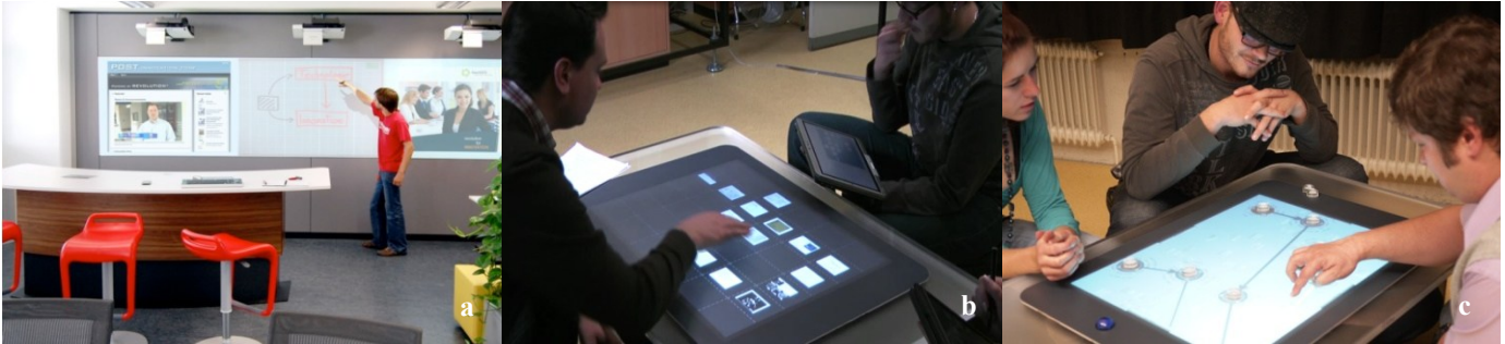
Figure 1: Interactive spaces based on post-WIMP DUIs. (a) NiCE Meeting Room [5], (b) DeskPiles [2] and (c) Facet-Streams [10]

2 University of Konstanz Human-Computer Interaction Group {jetter, reiterer}@inf.uni-konstanz.de