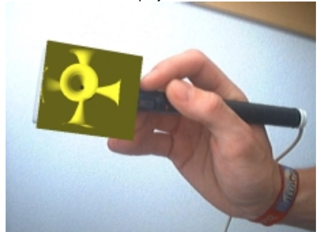
Figure 2: The ASR application allows a drag and drop of sound sources.

Current AR applications do not allow a direct manipulation of sound sources. ASR is the first prototype which combines sound and graphics in a AR environment and offers a wide spectrum for further applications. Especially in the authoring process for Augmented Reality applications it becomes difficult to place the sound sources using traditional 2D/3D based authoring tools. Now, the authors can place 3D sound sources in the real 3D space and they have a more intuitive experience how it really sounds. In the second application, which we are working on, the user can place virtual furniture in the room. This application will be combined with ASR, so that the user doesn't see the newly established room, but he also can hear how the radio or DVD player sounds.